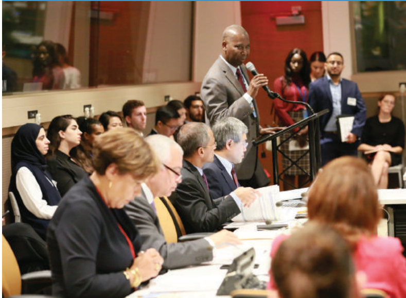
H.E. Professor Tijjani Muhammad-Bande, President of the United Nations 74 th General Assembly